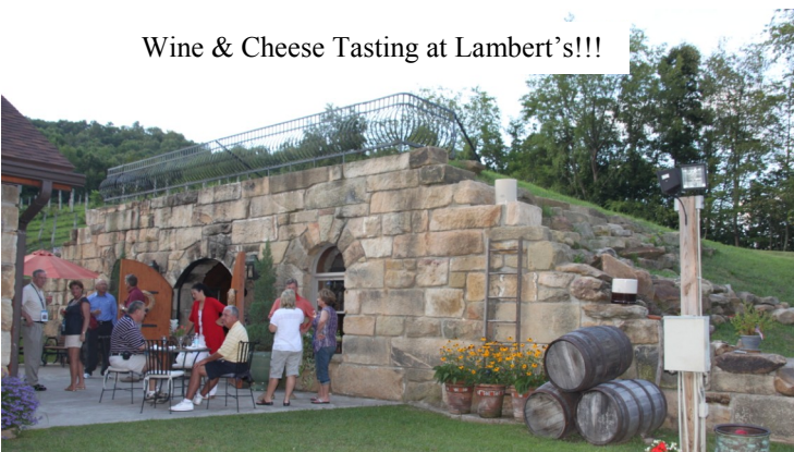
Wine & Cheese Tasting at Lambert's!!!

Over 180 people attended the 2010 CCAWV Annual Meeting at Stonewall Resort, August 1-3, 2010. We worked hard by day and played hard in the evenings. Just a few pictures to verify both!!!