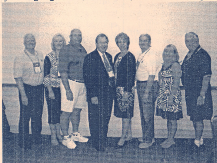
West Virginia Delegation of County Officials